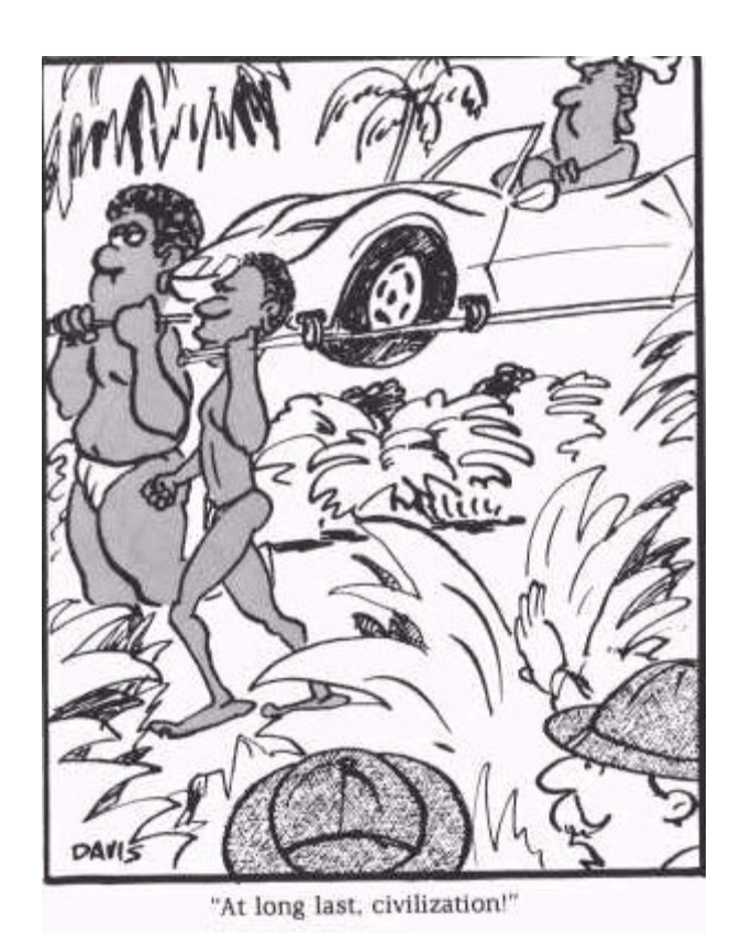
Copyright © 2016 River City Corvettes. All rights reserved.