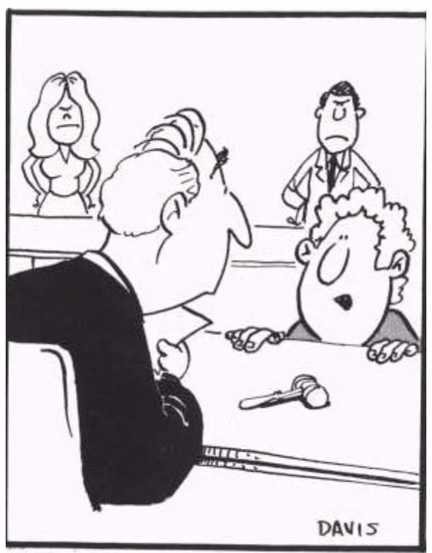
"Excuse me, Your Honor, but I don't think Corvette is the name of a child in this custody battle."