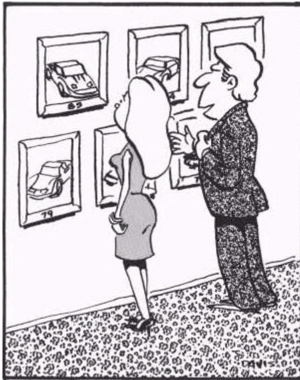
"...And here we have my family portraits..."

Copyright © 2007 River City Corvettes. All rights reserved.