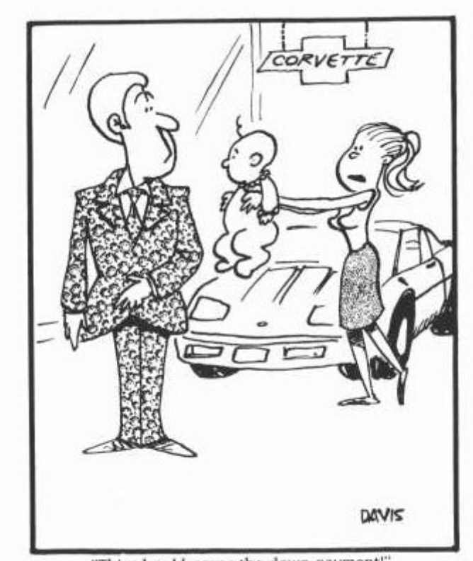
"This should cover the down payment!"