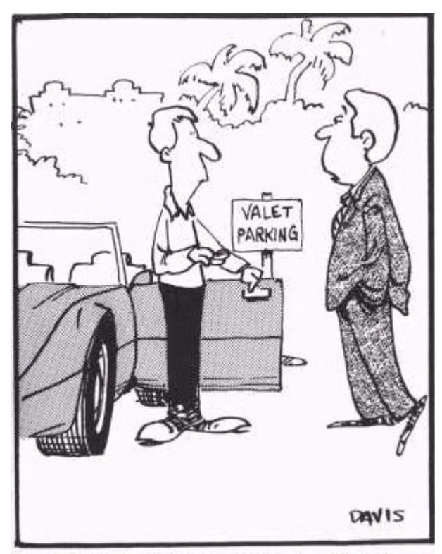
"Tip? You should pay me for the privilege!"