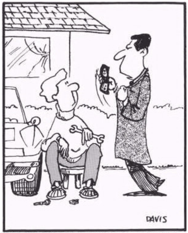
"Excuse me. I'm with the Corvette police and I'd like to ask you a few questions about those non-factory-original parts you're installing."