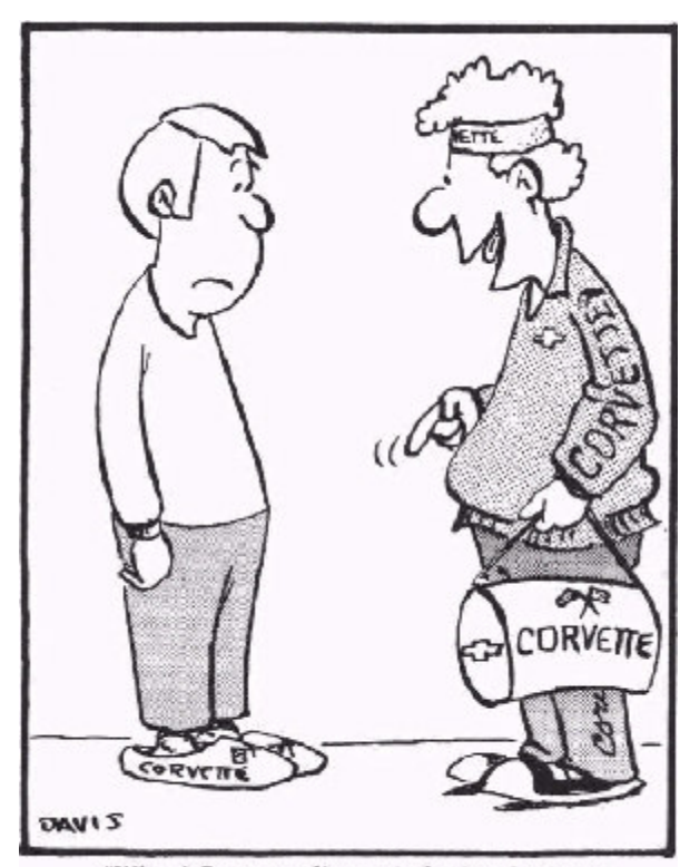
"Whoa! Corvette slippers? That's ridiculous!"