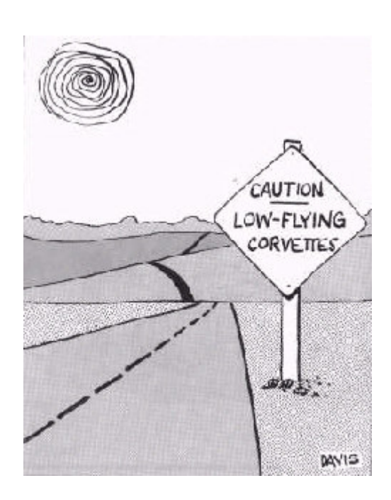
Copyright © 2012 River City Corvettes. All rights reserved.

RCC Webmaster, John Gesslein webmaster@rivercitycorvettes.com.