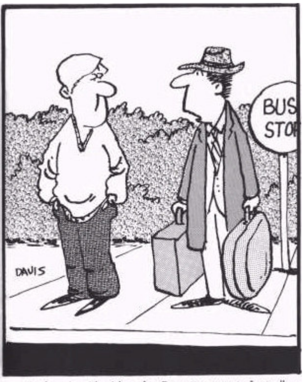
"...then I said, either the Corvette goes or I go ... "