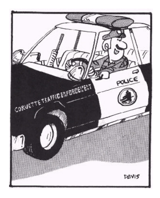
Copyright © 2018 River City Corvettes. All rights reserved.