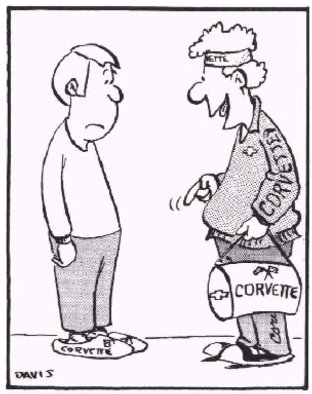
"Whoa! Corvette slippers? That's ridiculous!"