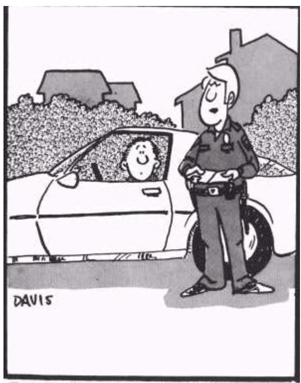
"Rats, I'm all out of tickets! Wait here, I'll be right back."