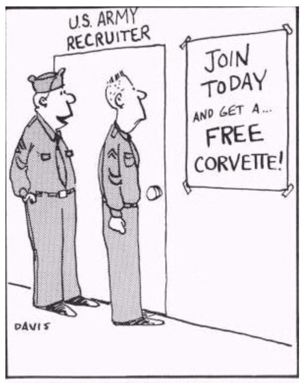
"Of course it's a lie! But by the time they find out, it'll be too late!"