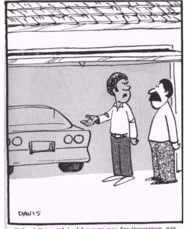
"What? Drive it? And have to pay for insurance, gas and repairs? What do I look like, a millionaire?"