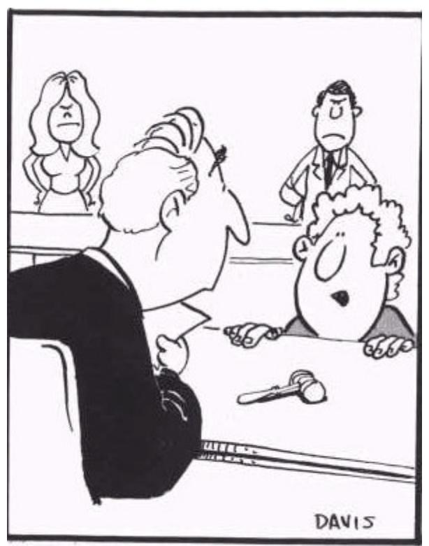
"Excuse me, Your Honor, but I don't think Corvette is the name of a child in this custody battle."