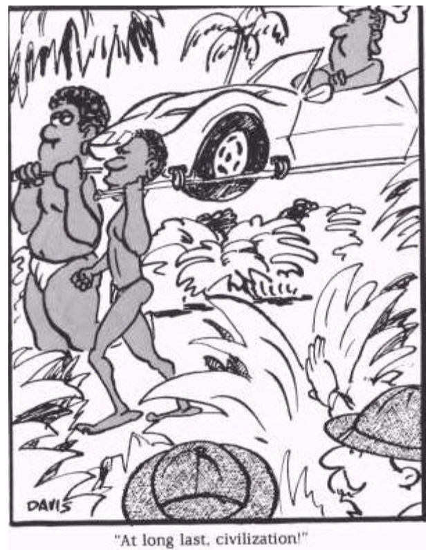
Copyright © 2008 River City Corvettes. All rights reserved.