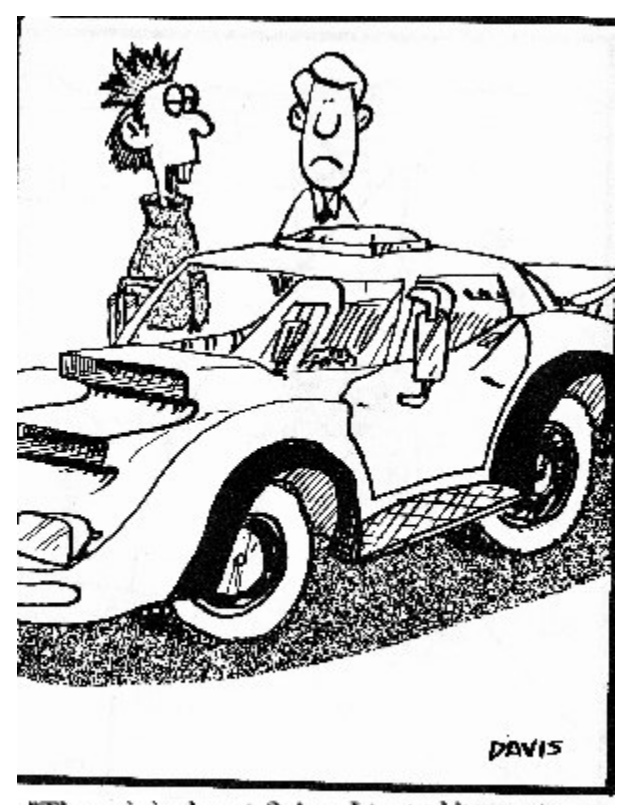
"The original parts? Aw, I tossed 'em out. They weren't good for anything."