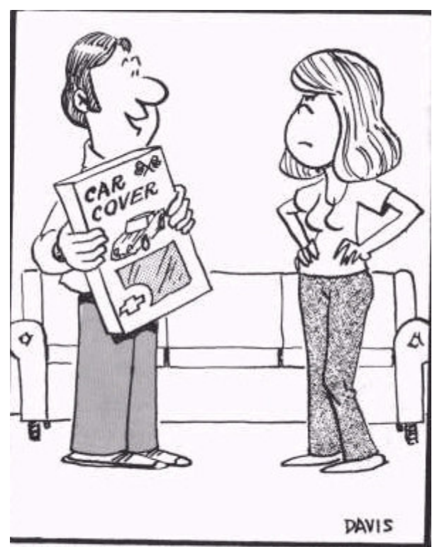
"I know I've already got a car cover for the Vette. This is a cover for the cover!"