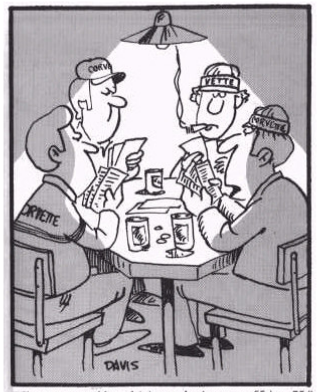
"I'll see your reckless driving and raise you a 65 in a 35."