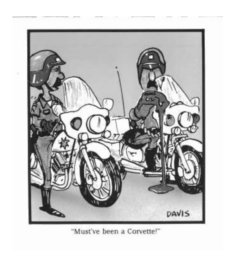
Copyright © 2010 River City Corvettes. All rights reserved.

RCC Webmaster, John Gesslein webmaster@rivercitycorvettes.com.