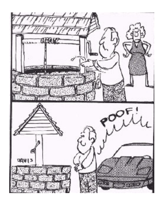
Copyright © 2005 River City Corvettes. All rights reserved.

John Gesslein webmaster@rivercitycorvettes.com.