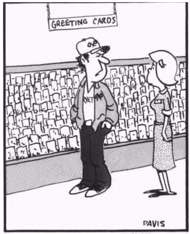
"Do you have one that says, 'Happy birthday to my Corvette'?"