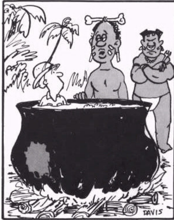
"Chief Mmmgbmwe say, 'you give Corvette, you go free!'"

Copyright © 2017 River City Corvettes. All rights reserved.