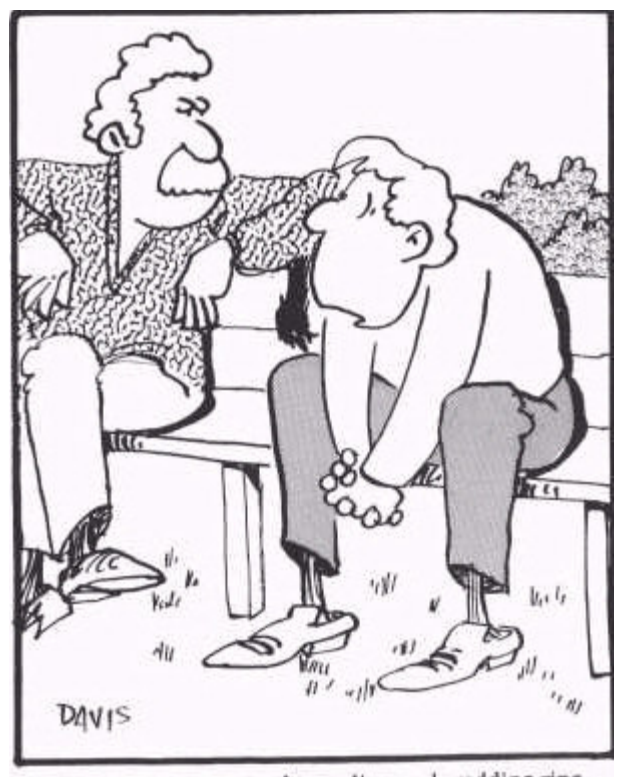
"I sold my Vette to get her a diamond wedding ring. She broke off the engagement because I no longer owned a Vette!"