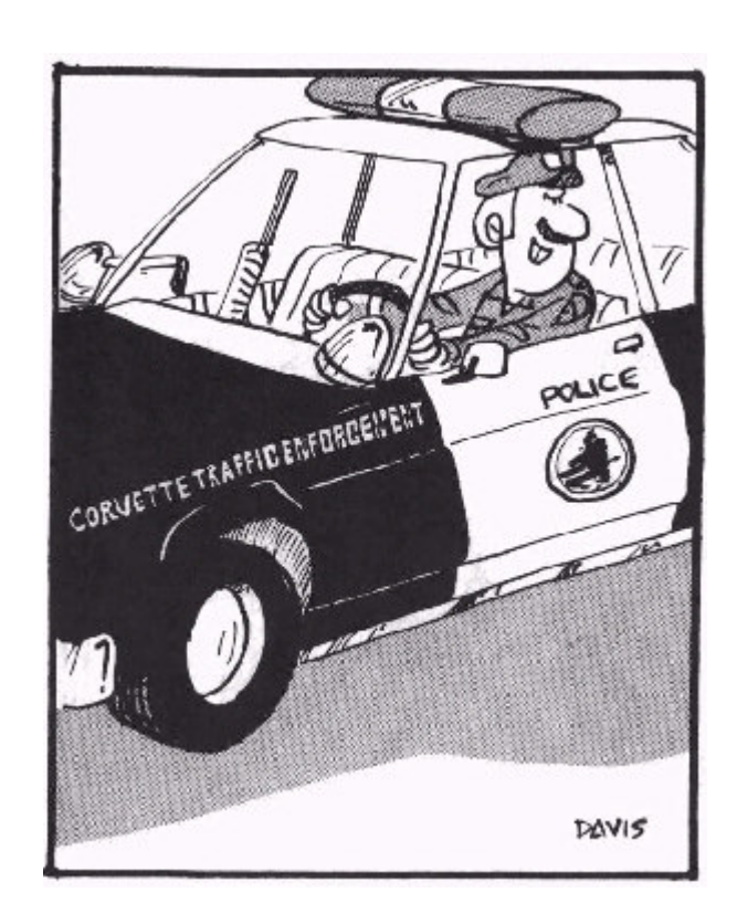
Copyright © 2011 River City Corvettes. All rights reserved.

RCC Webmaster, John Gesslein webmaster@rivercitycorvettes.com.