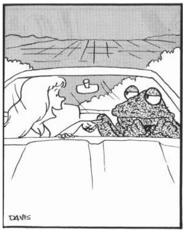
"Hey! No kidding! You are a frog! Oh, well, you've got a Vette!"