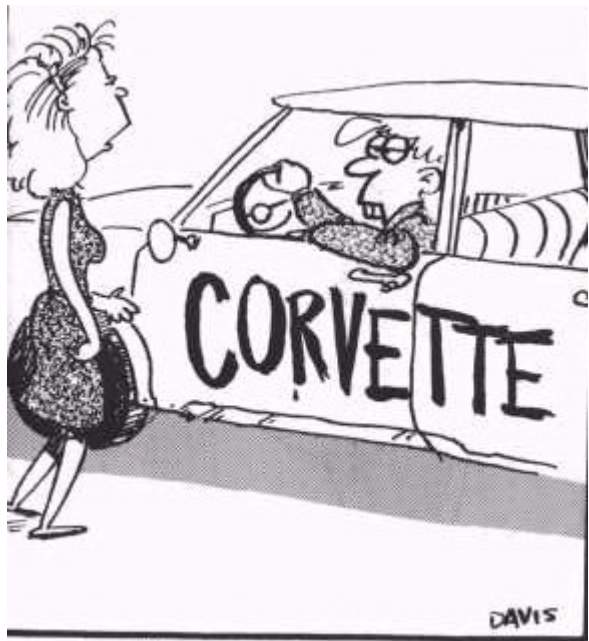
"Nice try, Harold, nice try."

Copyright © 2019 River City Corvettes. All rights reserved.