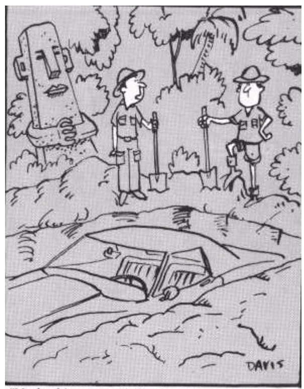
"Maybe this ancient civilization was more intelligent than we thought."