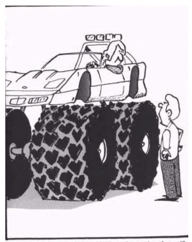
"Sorry, I don't think it'll become the national rage!"