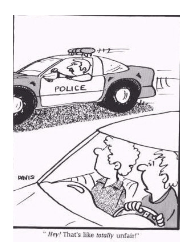
Copyright © 2016 River City Corvettes. All rights reserved.