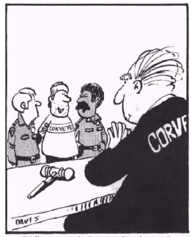
"Well, partner, I think we may lose this case."