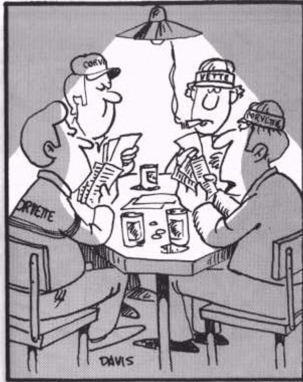
"I'll see your reckless driving and raise you a 65 in a 35."

Copyright © 2007 River City Corvettes. All rights reserved.