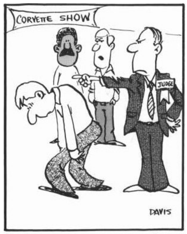
"What a disgrace! They found a non-original screw under the carpeting of his Vette!"